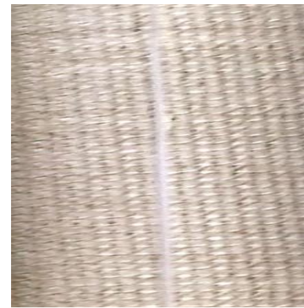
Outdoor Window Shades